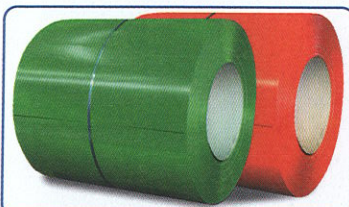
COLOUR COATED COILS